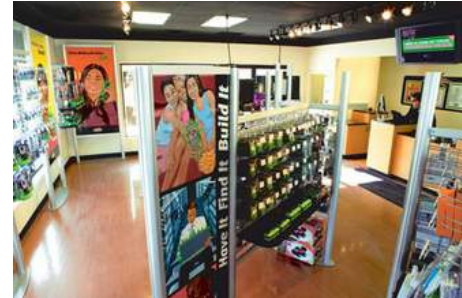
BATTERIES EVERYWHERE: Interstate Batteries is set to open a franchise in Tyler within 10 months.

Today, each retail location offers more than 16,000 types of batteries and power